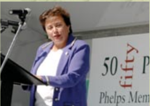
Congresswoman Nita Lowey