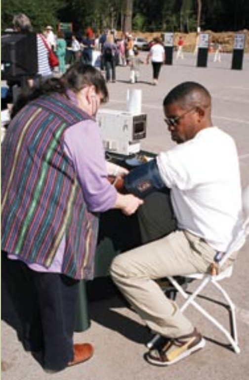
Free blood pressure screening at the Phelps 50th Anniversary Fair

Volunteers at the Hospital gave 44,000 hours of service, and Hospice volunteers gave 1,000 hours.